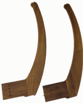
2× Long Leg