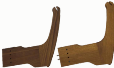
2× Short Leg